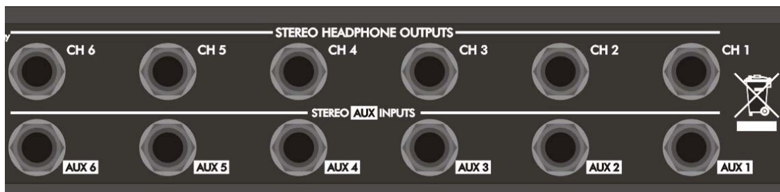
FIGURE 3 - Rear Panel Headphone Outputs and Aux Inputs

These XLR and 1/4-inch TRS jacks are hardwired in parallel with the corresponding BALANCED MAIN INPUT jacks. The BALANCED MAIN THRU jacks are useful for daisy chaining multiple HeadAmp 6 Pro units together.