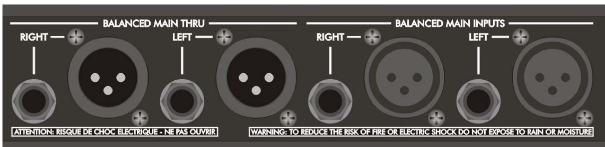
FIGURE 2 - Rear Panel Inputs