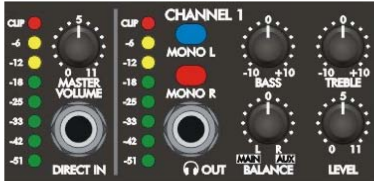
FIGURE 1 - Master Input and Channel One