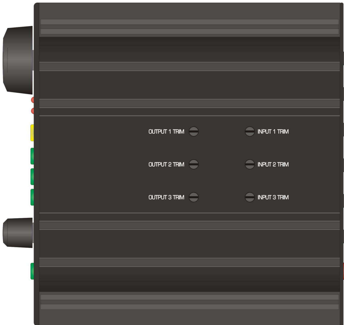
Bottom view - trimmers