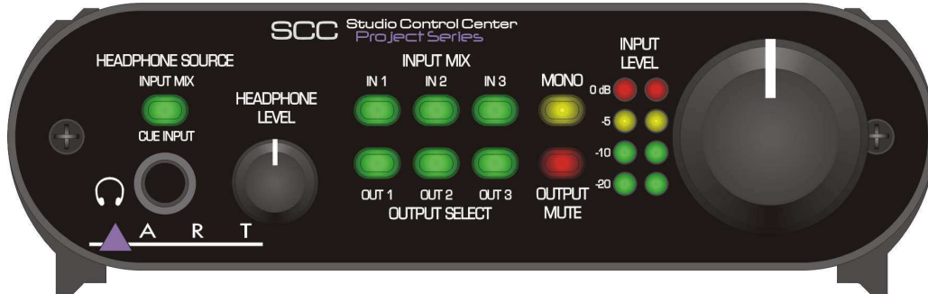
Front panel controls