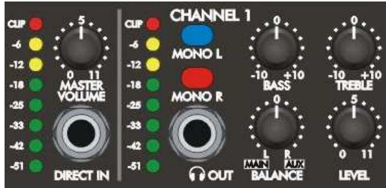
FIGURE 1 - Master Input and Channel One