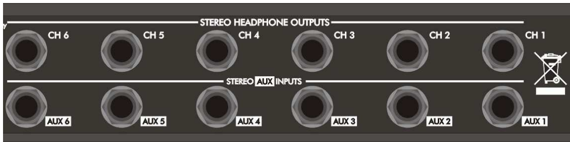
FIGURE 3 - Rear Panel Headphone Outputs and Aux Inputs

These XLR and 1/4-inch TRS jacks are hardwired in parallel with the corresponding BALANCED MAIN INPUT jacks. The BALANCED MAIN THRU jacks are useful for daisy chaining multiple HeadAmp 6 Pro units together.