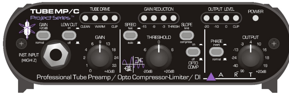
Figure 1 - Front view